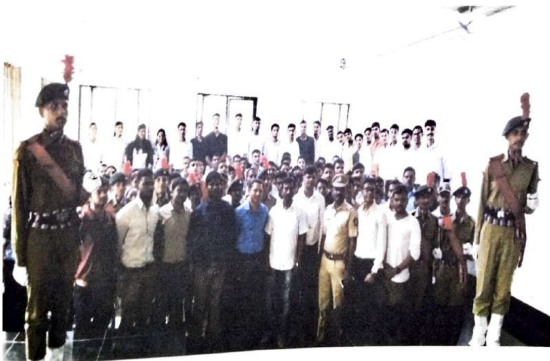
DBATU NCC UNIT