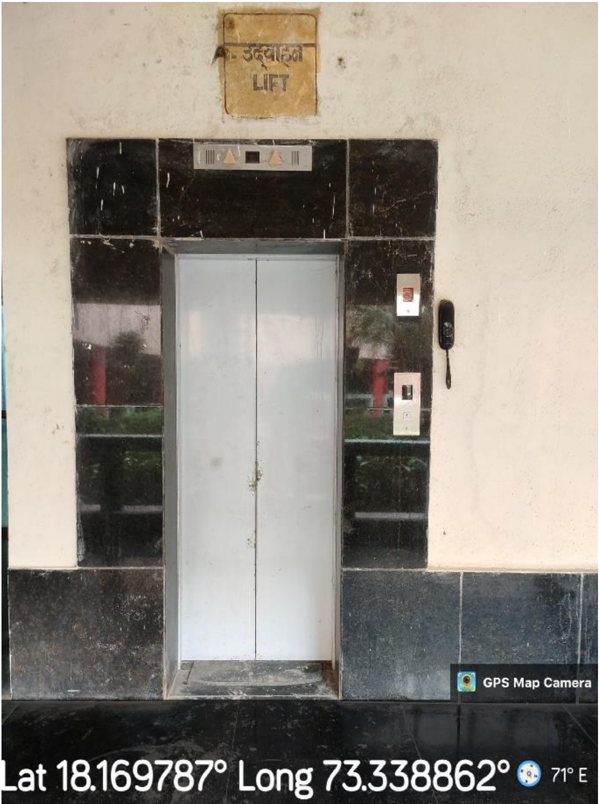
Photo 2 – Lift for easy access to higher storeys in the University Campus