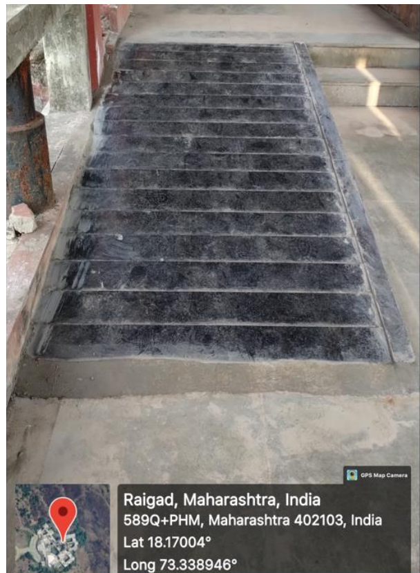
Photos 1– Ramps and Railing for easy access in the University Campus