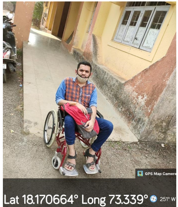
Photo 6 – Wheel Chairs for easy access to Divyangyan people in the University Campus